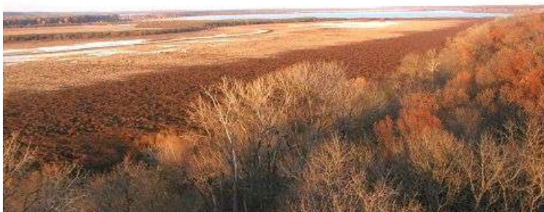
Illinois River Valley