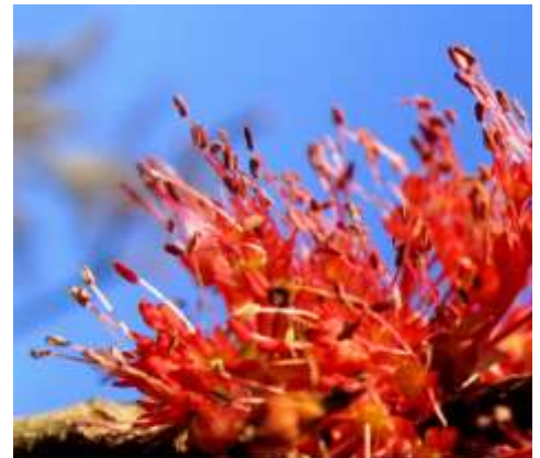
Acer rubrum var. drummondii Top - male tree / Bottom - female tree