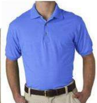
Carolina blue Polo example