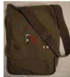
Field bag example

Note: due to the high cost of embroidery, the logo will be a simplified version without the gold sun backdrop.