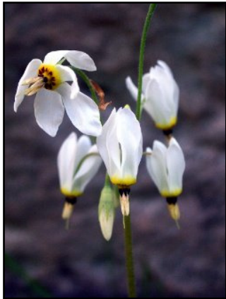
Dodecatheon frenchii – French’s Shooting Star

illinoisplants@gmail.com www.ill-inps.org