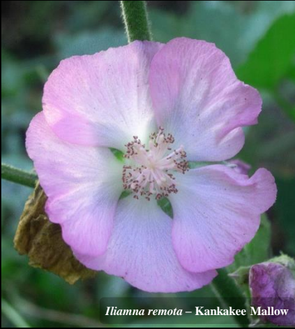
Iliamna remota – Kankakee Mallow