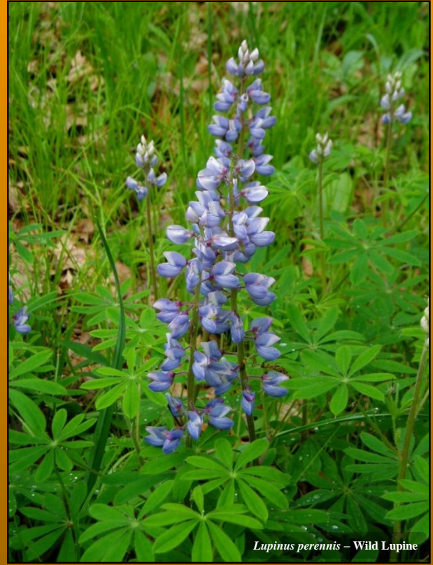
Lupinus perennis – Wild Lupine