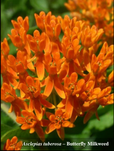
Asclepias tuberosa – Butterfly Milkweed

These beautiful plants can be found in a unique area known as the Kankakee Sands, site of the 2014 Illinois Native Plant Society Annual Meeting. Some of the finest examples of the globally rare black oak savanna occur here, as well as the Kankakee Mallow ( Iliamna remota ), one of the few endemic plants to Illinois. Also notable are Sweet Fern ( Comptonia peregrina ), Old Plainsman ( Hymenopappus scabiosaeus ), Creeping St. Johnswort ( Hypericum adpressum ), and Yellow Fringed Orchid ( Platanthera ciliaris ).