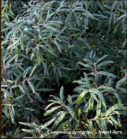
Comptonia peregrina – Sweet-fern