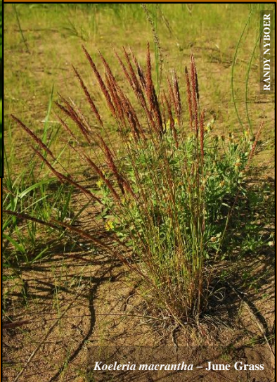
Koeleria macrantha – June Grass