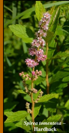
Spirea tomentosa – Hardhack

These beautiful plants can be found in a unique area known as the Kankakee Sands, site of the 2014 Illinois Native Plant Society Annual Meeting. Some of the finest examples of the globally rare black oak savanna occur here, as well as the Kankakee Mallow ( Iliamna remota ), one of the few endemic plants to Illinois. Also notable are Sweet Fern ( Comptonia peregrina ), Old Plainsman ( Hymenopappus scabiosaeus ), Creeping St. Johnswort ( Hypericum adpressum ), and Yellow Fringed Orchid ( Platanthera ciliaris ).