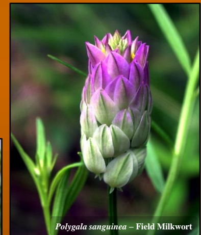
Polygala sanguinea – Field Milkwort