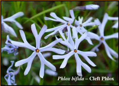
Phlox bifida – Cleft Phlox