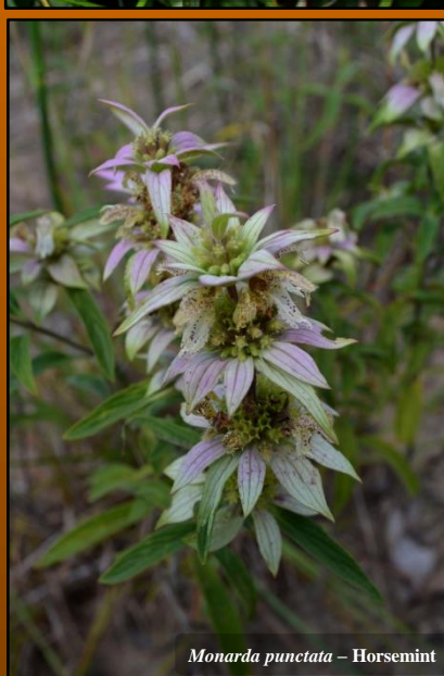
Monarda punctata – Horsemint