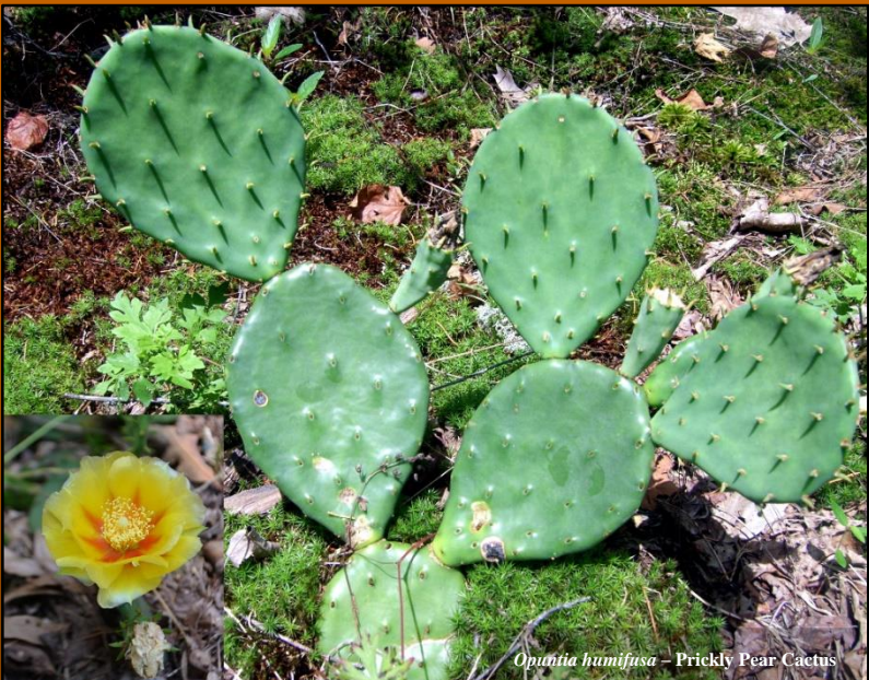
Opuntia humifusa – Prickly Pear Cactus