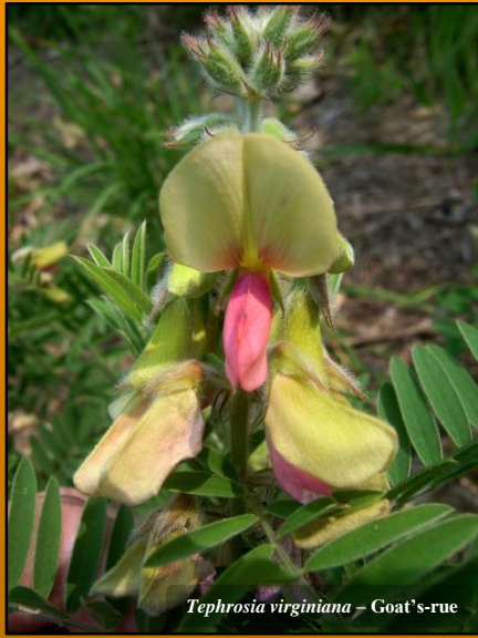
Tephrosia virginiana – Goat's-rue