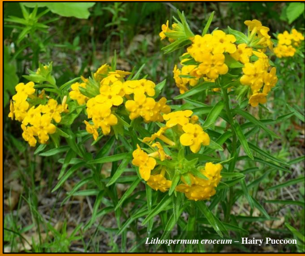
Lithospermum croceum – Hairy Puccoon