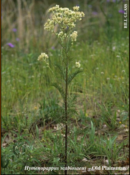
Hymenopappus scabiosaeus – Old Plainsman