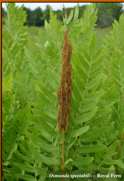
Osmunda spectabilis – Royal Fern