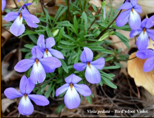
Viola pedata – Bird's-foot Violet