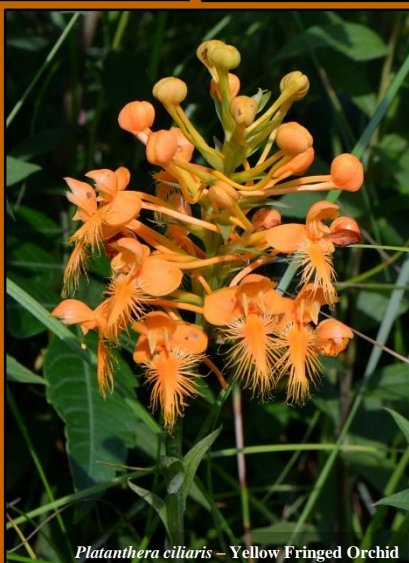
Platanthera ciliaris – Yellow Fringed Orchid