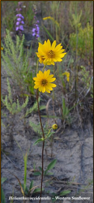
Helianthus occidentalis – Western Sunflower