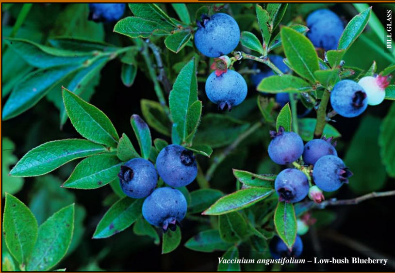
Vaccinium angustifolium – Low-bush Blueberry