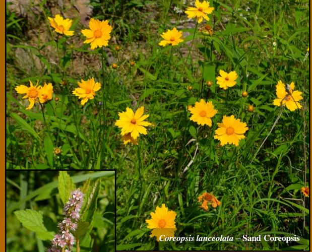
Coreopsis lanceolata – Sand Coreopsis