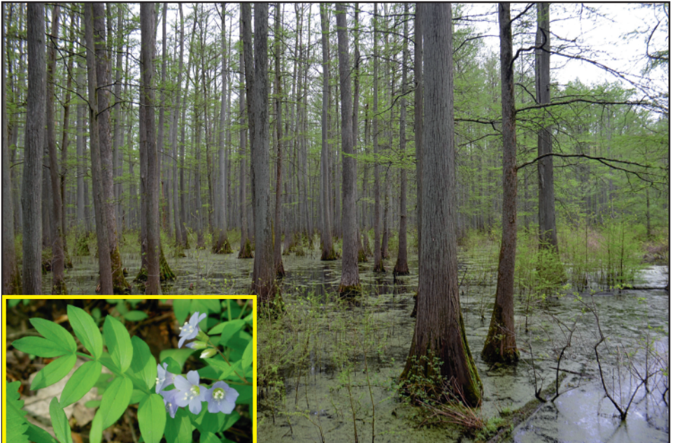
Cypress swamp. Jacob's ladder (inset)