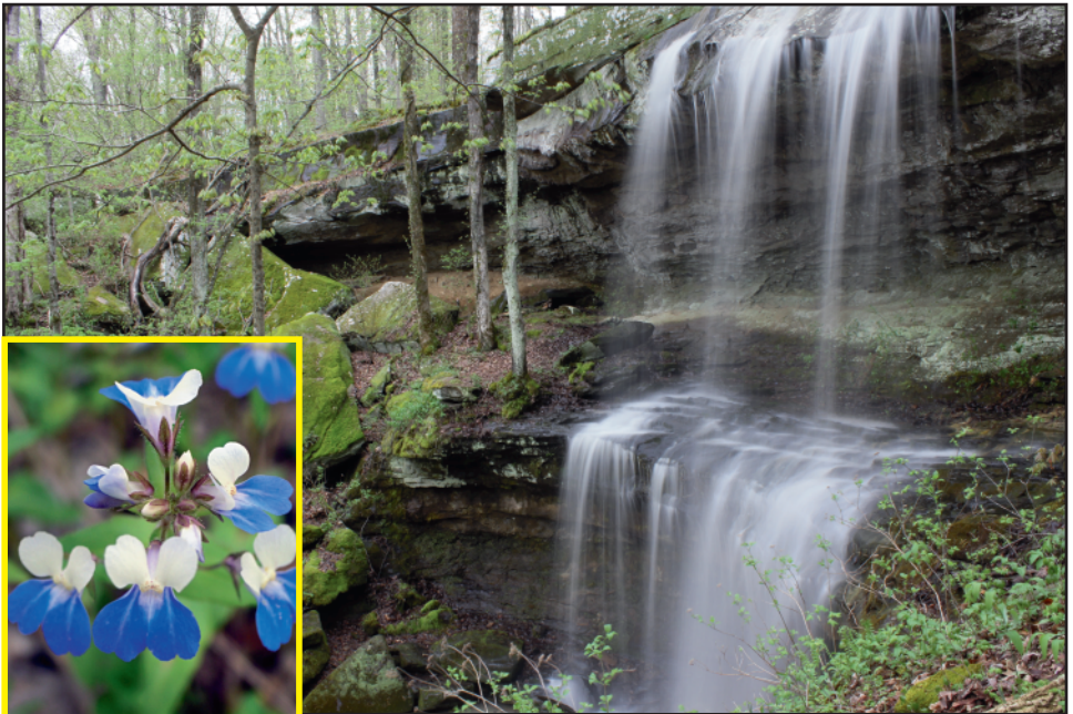
Waterfall along the trail. Blue-eyed Mary (inset)