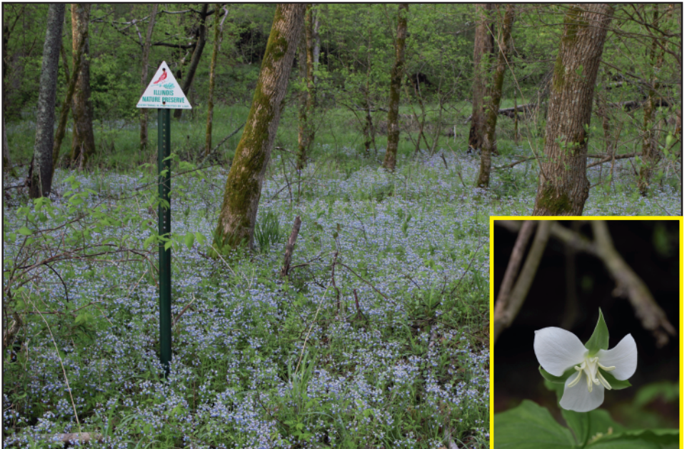
A field of blue-eyed Mary. White trillium (inset)