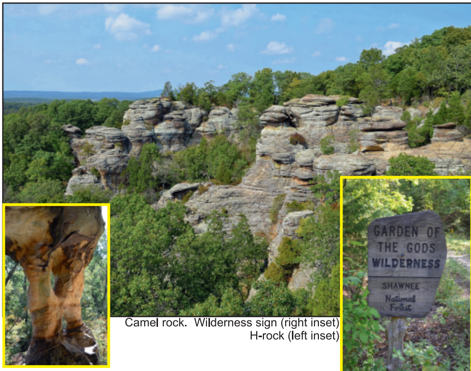
Camel rock. Wilderness sign (right inset) H-rock (left inset)