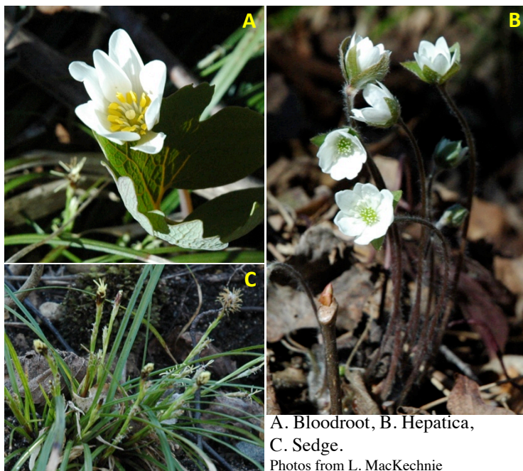
A. Bloodroot, B. Hepatica, C. Sedge.

It was known as the Elgin Botanical Gardens for many years and was managed accordingly. Some of the management practices are still visible, such as the persistent patches of daffodils and Siberian Squill ( Scilla siberica ). The park has been heavily visited for over 100 years. Sadly, the park was bisected by the construction of the I-90 highway in 1957. The park was dedicated as an Illinois Nature Preserve in 1972. Today, the fen community is split into two parcels, the southern portion which we visited, and a northern parcel, the Fox River Forested Fen Forest Preserve of Kane County.