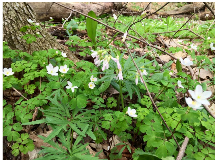
Dentaria laciniata and Isopyrum (Enemion) biternatum

A partial species list for the site follows: Allium tricoccum , Andropogon gerardii , Antennaria neglecta , Camassia scilloides , Carpinus caroliniana virginiana , Caulophyllum thalictroides , Ceanothus americanus , Claytonia virginica , Dentaria laciniata , Dicentra cucullaria , Dirca palustris , Erythronium albidum , Hydrophyllum virginianum , Isopyrum biternatum , Mertensia virginica , Podophyllum peltatum , Quercus alba , Quercus macrocarpa , Quercus rubra , Quercus velutina , Ranunculus fascicularis , Ribes americanum , Scrophularia marilandica , Solidago ulmifolia , Sorghastrum nutans , Symplocarpus foetidus , Thalictrum dioicum , Uvularia grandiflora