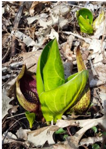
Symplocarpus foetidus (Skunk Cabbage)