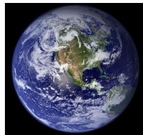
Earth Satellite Image ( http://www.jpl.nasa.gov/news/news.php?feature=3904 )

Spring is upon us, with dozens of events this month including special celebrations associated with Earth Day (4/22) and Arbor Day (4/29). A few of the special events are listed immediately below.