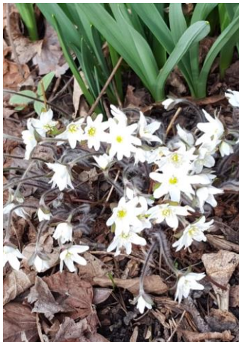
Hepatica acutiloba (Sharp-Lobed Hepatica)