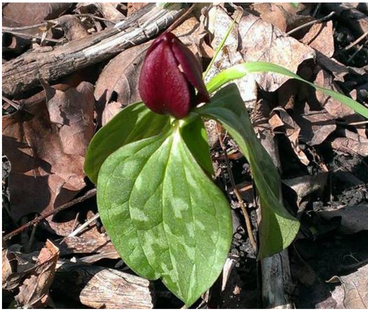
Trillium recurvatum (The Bloody Butcher, Prairie Trillium) (photo: L. MacKechnie, G.A.R. Woods, River Forest, May 1, 2015)

Learn about ecological restoration efforts in Sites Seldom Seen: Newly Freed Springs , a tour of wetland projects in Glacial Park (4/16; $2 fee for non-residents). Visit Coral Woods in Marengo for a Woodland Wildflower walk on 4/24. Download the latest issue of Landscapes , the Conservation District magazine for more information.