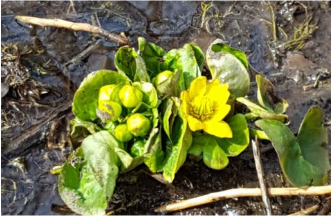
Caltha palustris (Marsh Marigold)