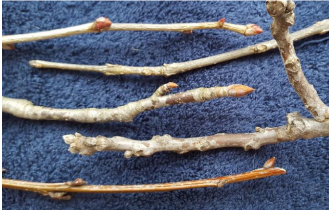
Tree twigs from our visit (more to come later)

trips because you will learn a lot as I have been this past year with INPS. You learn a lot of plant ID, ecological knowledge, and background information on the sites that we visit. Hope to see you all at our next field trip.