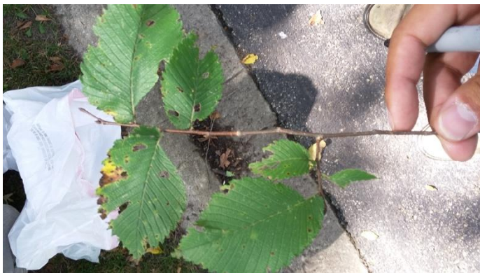
Ulmus americana (American elm)