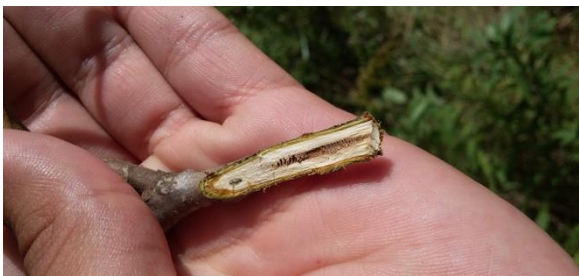
Chambered pith of Juglans nigra (Black Walnut)