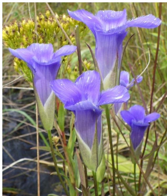
Gentiana procera (Small fringed gentian)