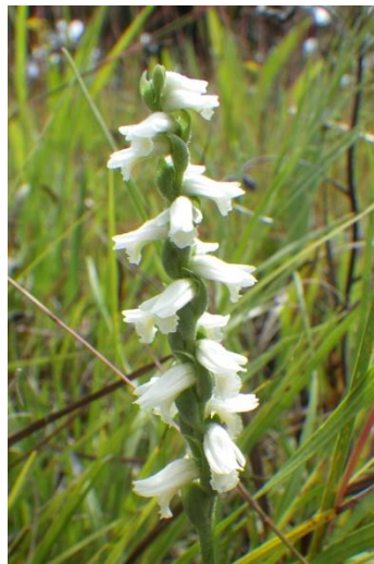
Spiranthes sp. (Ladies' tresses)

I'm also excited to announce that we'll be visiting Volo Bog in Ingleside (Lake County) next weekend (October 22 or 23) for a field trip with the hope of taking in some uncommon fall color for our area! We're hoping the time is right to catch tamarack ( Larix laricina ) and poison sumac ( Rhus vernix ) in their fall color beauty as we stroll the boardwalk at one of our region's truly special natural areas. Stay tuned for an email with our finalized date and time once they're decided and we'll hope to see you there! -Andy