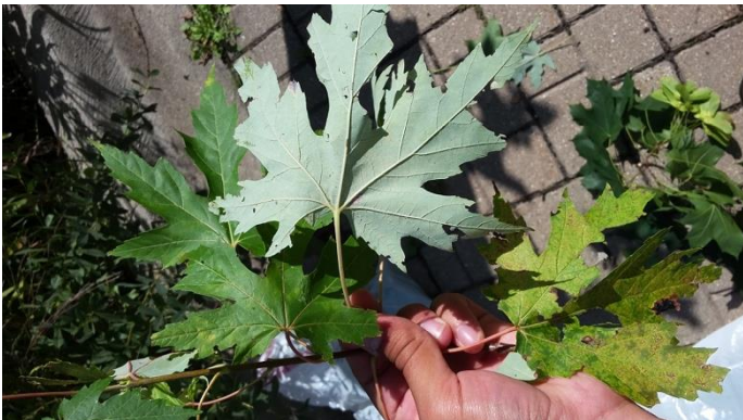
Acer saccharinum (Silver maple)