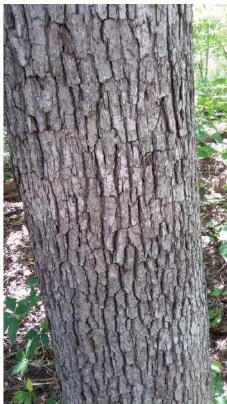
Quercus alba (White oak) leaves and bark