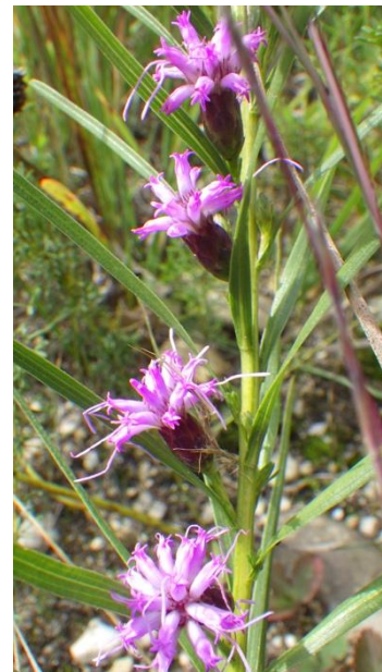
Liatris cylindracea (Cylindrical Blazing Star)