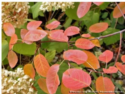
Serviceberry Fall Color ( Amelanchier x grandiflora 'Autumn Brilliance')