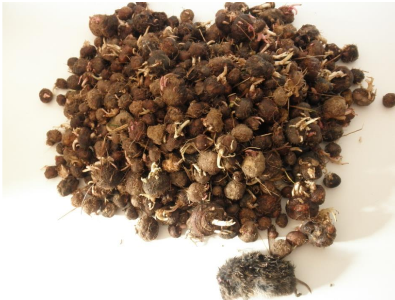
Liatris corms found in den of deceased prairie vole

This past fall I saw little vole activity and did not mow some low risk areas of the prairie. By December, I saw vole damage and finished mowing those areas. Soon after, our small dog began digging up vole dens.