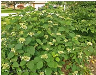
Smooth Hydrangea ( Hydrangea arborescens )

Instead, a garden with a few, well-chosen plants, with thought to flowering times, height and spread of individual plants, as well as their soil moisture and sunlight requirements, has greater visual impact. Plants that are given room to show off their full potential are healthier, look their best, and require less hands-on attention by the gardener.