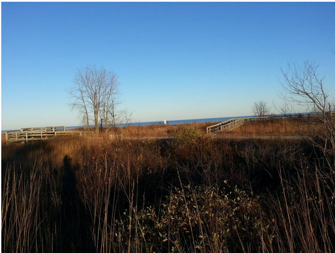
Hosah Prairie: Plain but Rich

When a natural area lacks sex appeal, the public ignores it, which can be a very good thing. Such is the case with Hosah Prairie, a pristine 22.5-acre duneland that's located next to Lake Michigan between the south and north units of Illinois Beach State Park (IBSP). Rectangular-shaped, Hosah has one-quarter mile of beach running north to south, but the sand is so rock-filled that swimmers and sunbathers go elsewhere.