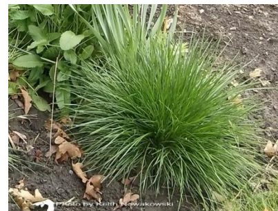
Tufted Hair Grass ( Deschampsia cespitosa )

Do not space your plants two feet apart so they never touch one another. That is just asking for rampant weed growth and random seedling volunteers from the wildflowers and grasses. Nature always wants to fill a void. Instead, group plants that work well together. An example is Redtwig Dogwood ( Cornus alba 'Sibirica'), underplanted with Waukegan Juniper ( Juniperus horizontalis 'Waukegan') and Tufted Hair Grass ( Deschampsia cespitosa ) in a sunny location, or a multi-stemmed Serviceberry ( Amelanchier x grandiflora 'Autumn Brilliance') with Smooth Hydrangea ( Hydrangea arborescens ) and Wild Geranium ( Geranium maculatum ) in partial sun. Both of these combinations provide multiple seasons of interest as well as food for pollinators and songbirds.