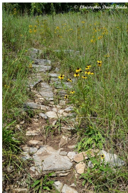
Missouri Coneflower, Rudbeckia missouriensis , at Fults Hill Prairie Nature Preserve in Monroe County, Illinois.

Thank you so much for your interest in INPS! Please spread the word and hopefully one day soon I will see you out there among the wildflowers!