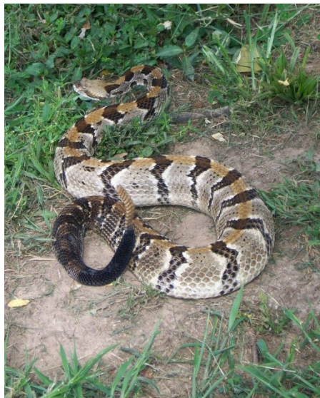
Timber Rattlesnake

Over two memorable years I made 73 seed collections (24 RFSS, 14 RFSS Eastern Region, and 19 associate species) representing 57 different species. Many more species and locations were documented, although seed collection for these was not possible due to circumstances. All collections and finds were reported to the FS, the Seedbank, and, where state listed, to the Illinois Natural Heritage Database.