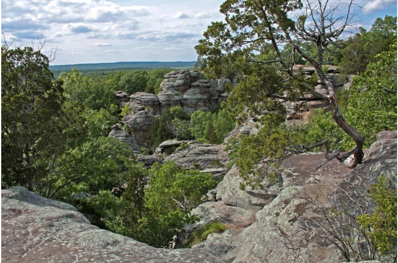
Shawnee National Forest

"...dedicated to the preservation, conservation, and study of native plants and vegetation in Illinois."