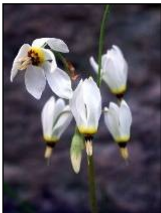
Dodecatheon frenchii – French's Shooting Star

illinoisplants@gmail.com www.ill-inps.org