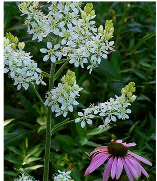
Melanthium virginicum , state-threatened Virginia bunchflower lily, with purple coneflower.

Eilers counts six plant communities at HESCCA: upland forest, floodplain, flatwoods, barrens, old fields, and wetlands (seep and sedge meadow). He calls the upland forest “a microcosm of several woodland categories that are representative of the Central Hardwood Region.”