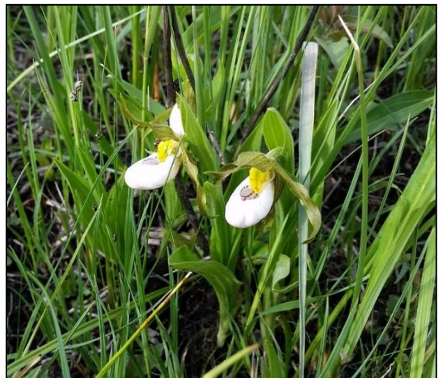
Cypripedium candidum , small white lady's slipper.

From then on, every weekend included a plant hike or three. Every day at work I was watching plant phenology for hints of flowering. Vacations were re-scheduled, and nights became a time for strategizing and research. Early in the year I watched the Illinois Botany Facebook group for hints of where things would be flowering and when. I made a few trips to the Morton Arboretum to try and find butterbur ( Petasites hybridus ) which someone had posted with pictures and a location. How easy! Then came snow trillium ( Trillium nivale ) and rattlesnake plantain ( Goodyera pubescens ). Soon after that I was able to join a camping trip to southern Illinois; a whole different flora to capture, and an absolutely magical introduction to the area.