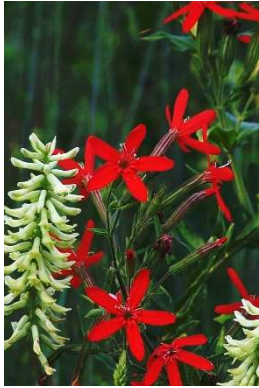
Silene regia , royal catchfly By Henry Eilers