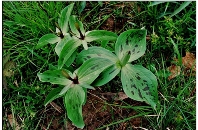
Trillium viride , state-endangered green trillium, originally from adjacent Macoupin Co., some 12 miles west.

Absence of fire in the years before restoration allowed sugar maples ( Acer saccharum ) to invade the woodlands, where they began to dominate. Sugar maples grow fast and create a dense shade when mature. Maple seedlings are shade tolerant while oaks and hickories, which grow slowly, are not. When we visited the site, Eilers pointed out stands of sugar maples with hardly any ground layer beneath them, while tree seedlings and wildflowers thrived under the oaks and hickories.