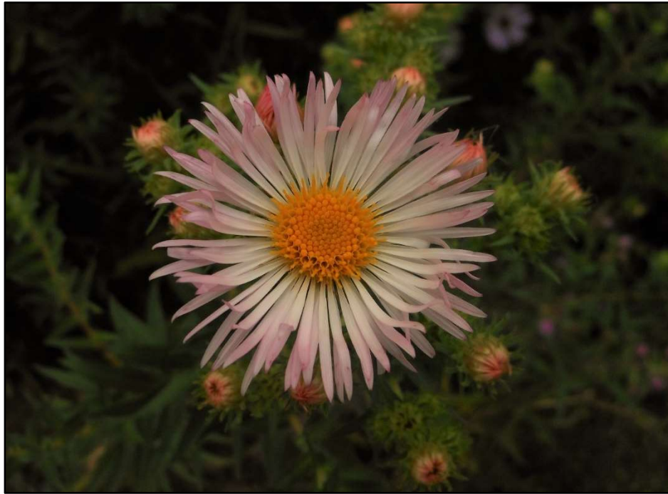
New England aster, Aster novae-angliae , spontaneous color form, one of many in old-fields.

“...dedicated to the study, appreciation, and conservation of the native flora and natural communities of Illinois.”