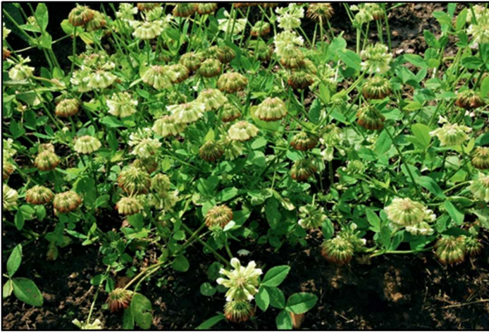
Buffalo clover, Trifolium reflexum , an annual species of barrens and flat-woods communities.

Fire is no cure-all. Even after fire, many native species were slow to recover. Restoration is a process. But some natives like the buffalo clover ( Trifolium reflexum ) came out of the seed bank after fire scarified its hard seeds.