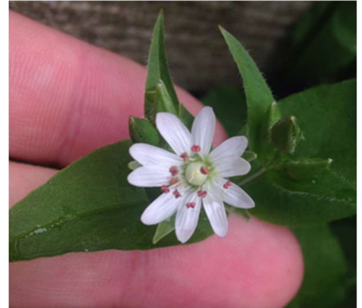
Stellaria corei, Tennessee starwort.