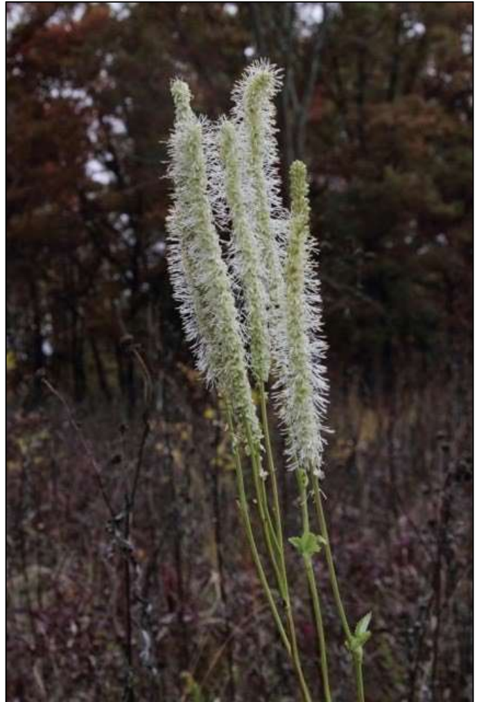
American burnet, Sanguisorba canadensis, at Somme Prairie Grove Nature Preserve.