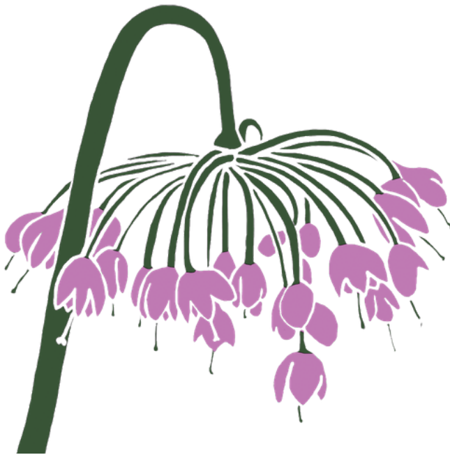
Illustration by Kathleen Garness