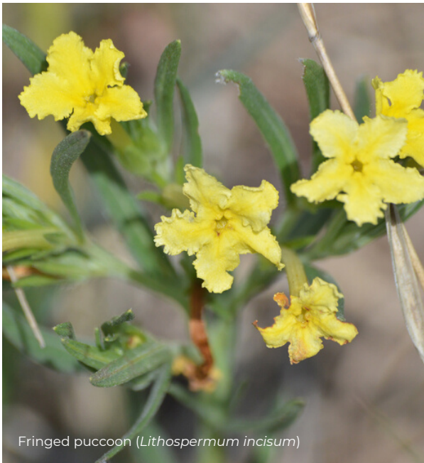
Fringed puccoon ( Lithospermum incisum )