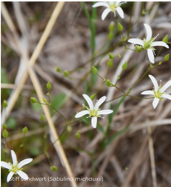
stiff sandwort ( Sabulina michauxii )