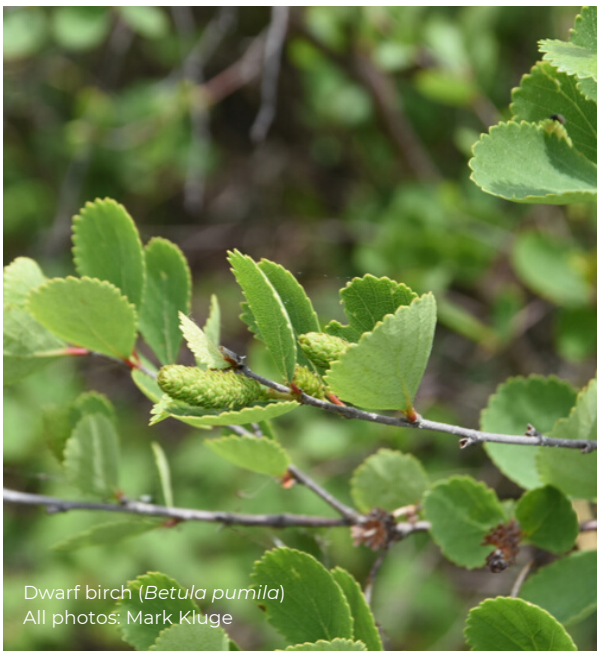
Dwarf birch ( Betula pumila )

Hosah Park's 23 lakefront acres are home to 240 documented species of plants, of which 206 are native. The total mean C is 5.5, with a native mean C of 6.5. There are 20 listed species, and many more very conservative ones, as would be expected in a Grade A/B remnant lakefront sand prairie.