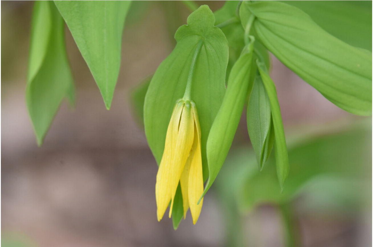
Photo: Uvularia grandiflora

Newsletter of the Northeast Chapter of the Illinois Native Plant Society