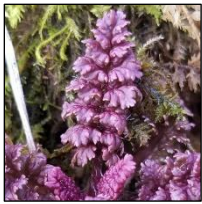
Wood Betony ( Pedicularis canadensis ).