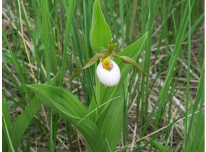
Small white lady's-slipper ( Cypripedium candidum ) Observed: May 26, 2019, Chicago Suburban Area

We met up at the parking lot of a Dairy Queen in Anna, Illinois, from which I proceeded to miss my turn west. Yay. Eventually, we made it to Larue-Pine Hills, where I got to show them everything from the state-listed heartleaf nettle to the state-threatened northern starhead topminnow ( Fundulus dispar ) to the northern cottonmouth ( Agkistrodon piscivorus ) for which Snake Road gets its colloquial name. Resurrection fern ( Pleopeltis michauxiana ), western tansy mustard ( Descurania pinnata ), western buttercup phacelia ( Phacelia ranunculacea )...the uncommon plants increased as we went along, and by the end of the day I'd managed to show them a good variety of the species present at Larue-Pine Hills in mid-April. I was at 315 species by April 18, and I decided to just go forth and do my best to accomplish this Botany Big Year. I began to question what else I needed to find. For instance, how on God's green earth do I ID sedges? I still don't feel like I've answered that question sufficiently. I still think I missed so many sedges that I should've tried for more readily.