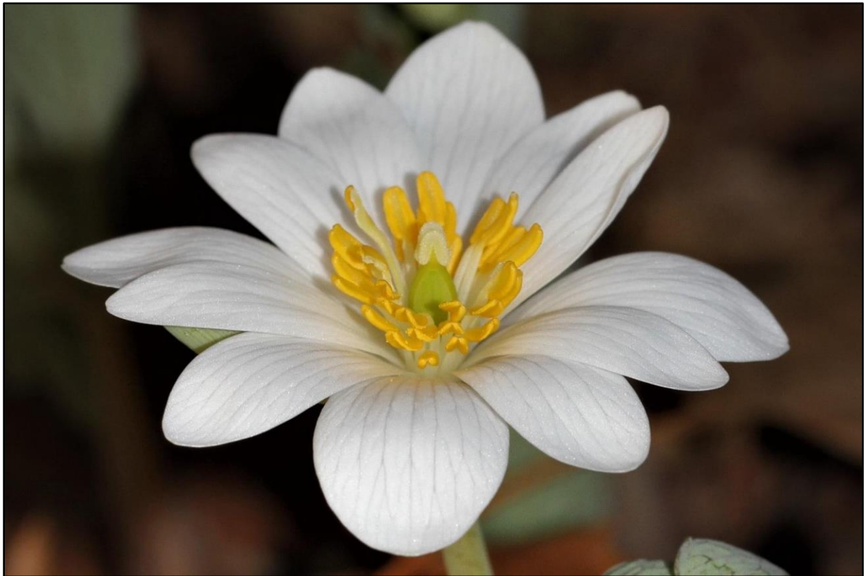
Bloodroot ( Sanguinaria canadensis ).

“...dedicated to the study, appreciation, and conservation of the native flora and natural communities of Illinois.”