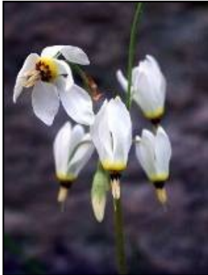
Dodecatheon frenchii – French's Shooting Star

southernillinoisplants@gmail.com www.ill-inps.org