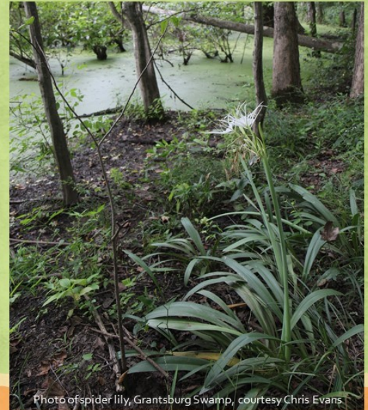
Photo of spider lily, Grantsburg Swamp